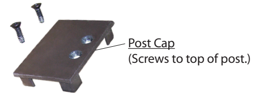
Post Cap (Screws to top of post.)