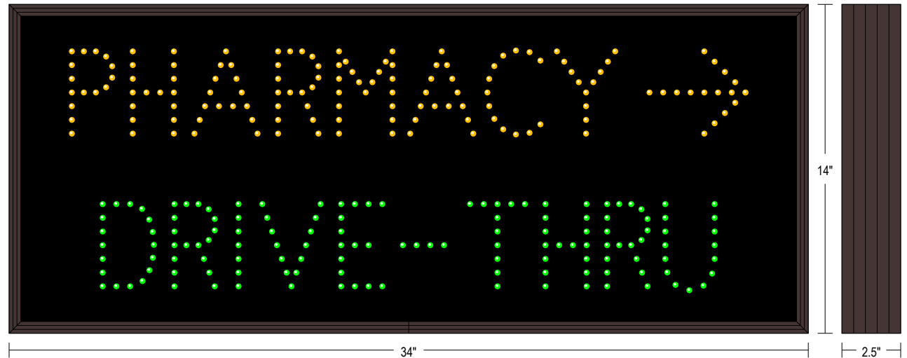
Sample Display Options

NOTE: Sign image may not exactly represent the finished product. For illustration purposes only.