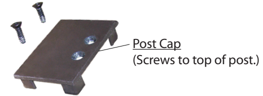
Post Cap (Screws to top of post.)