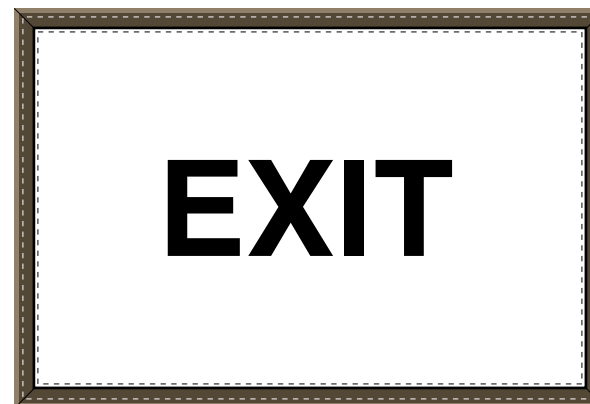
SIDE B VIEW