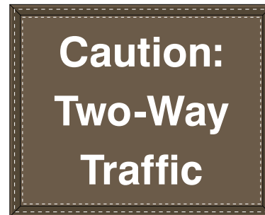
SIDE B VIEW