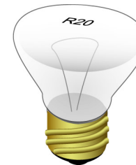
10,000-Hour Life Expectancy