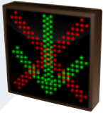
X | Down Arrow 10" h × 10" w × 2½" d ID#: 45658 ID#: 47836 12-24VDC