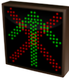
X | Up Arrow 10" h × 10" w × 2½" d ID#: 47642 ID#: 47632 12-24VDC