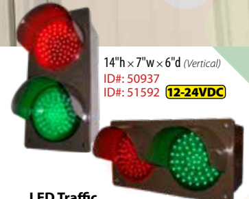
14" h × 7" w × 6" d (Vertical) ID#: 50937 ID#: 51592 12-24VDC