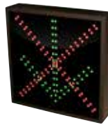
X | Down Arrow 12" h × 12" w × 2½" d ID#: 7577 ID#: 30070 12-24VDC