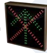
X | Up Arrow 12" h × 12" w × 2½" d ID#: 9895 ID#: 31681 12-24VDC