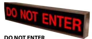
DO NOT ENTER 7" h × 34" w × 2¼" d ID#: 25932