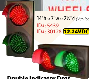
14" h × 7" w × 2½" d (Vertical) ID#: 5439 ID#: 30128 12-24VDC