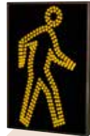
Right Pedestrian Symbol 16" h × 12" w × 2½" d ID#: 39857