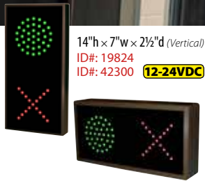
14" h × 7" w × 2½" d (Vertical) ID#: 19824 ID#: 42300 12-24VDC