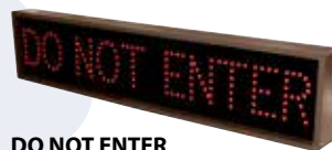
DO NOT ENTER 7" h × 34" w × 2½" d ID#: 6104