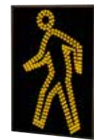
Left Pedestrian Symbol 16" h × 12" w × 2½" d ID#: 38392