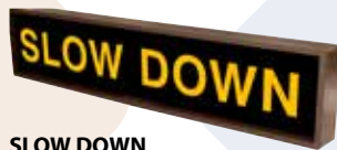
SLOW DOWN 7" h × 34" w × 2¼" d ID#: 49877