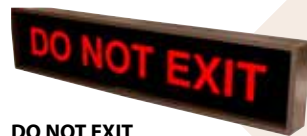
DO NOT EXIT 7" h × 34" w × 2¼" d ID#: 28505