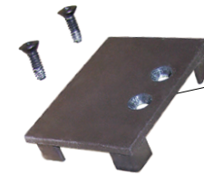
Post Cap (Screws to top of post.)