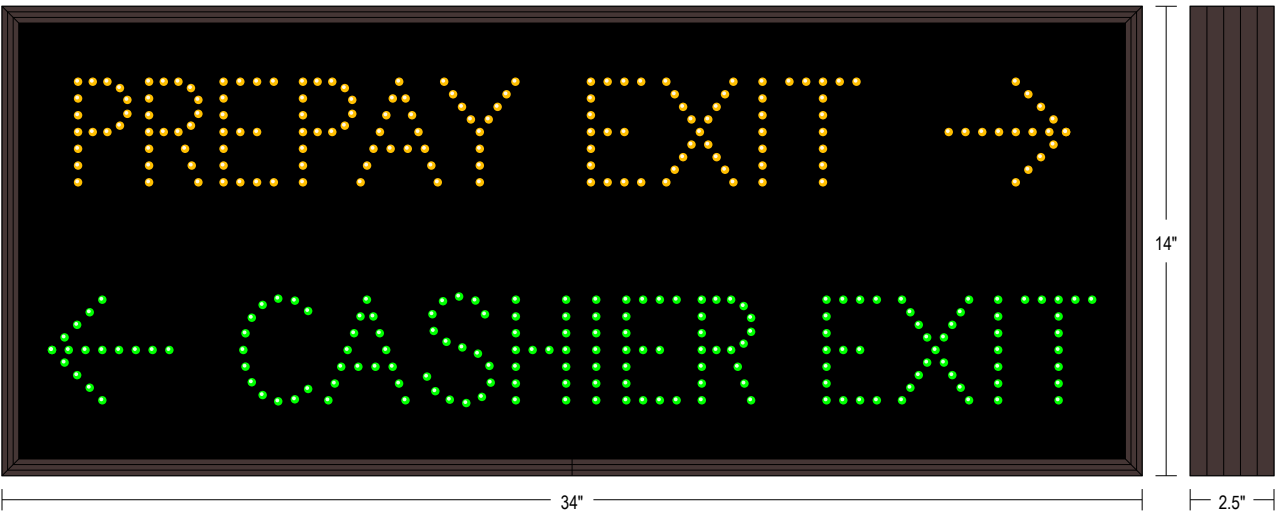
Sample Display Options

NOTE: Sign image may not exactly represent the finished product. For illustration purposes only.